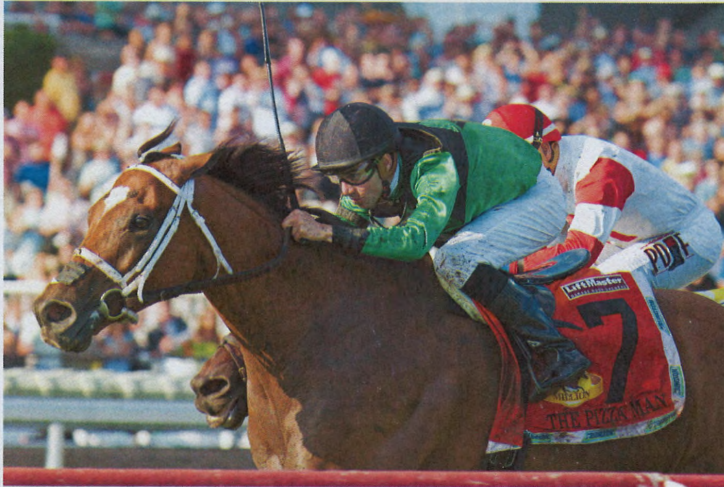
2015 Illinois Thoroughbred Horse of the Year The Pizza Man