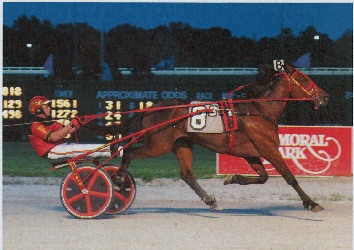
2015 Illinois Harness Horse of the Year Captain Greedy