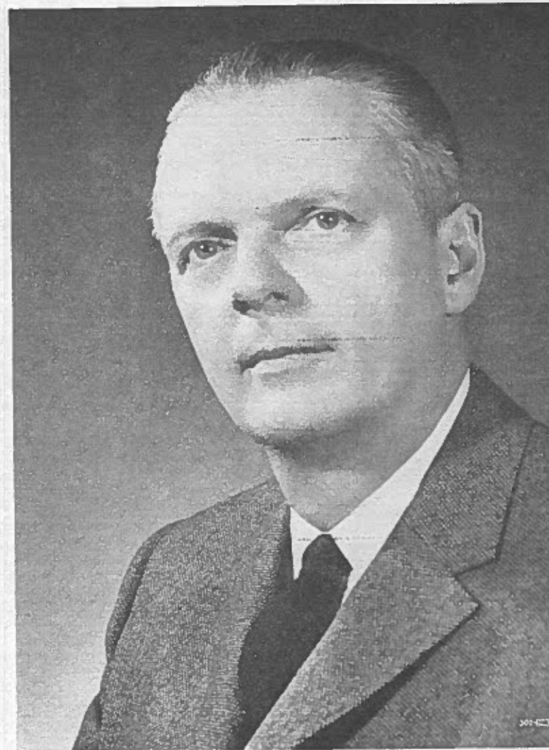
THE HONORABLE WILLIAM G. STRATTON Governor of Illinois