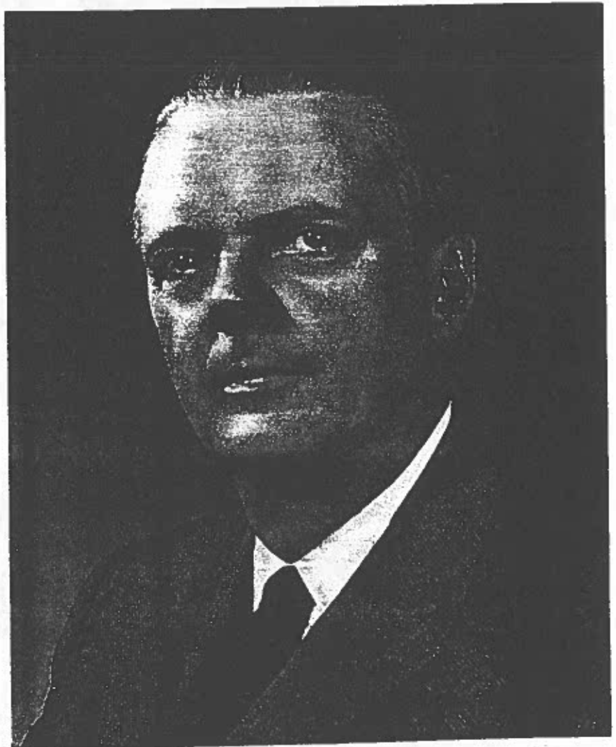
THE HONORABLE WILLIAM G. STRATTON Governor of Illinois