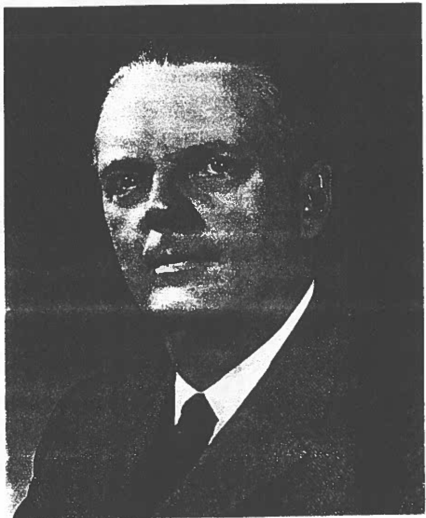
THE HONORABLE WILLIAM G. STRATTON Governor of Illinois