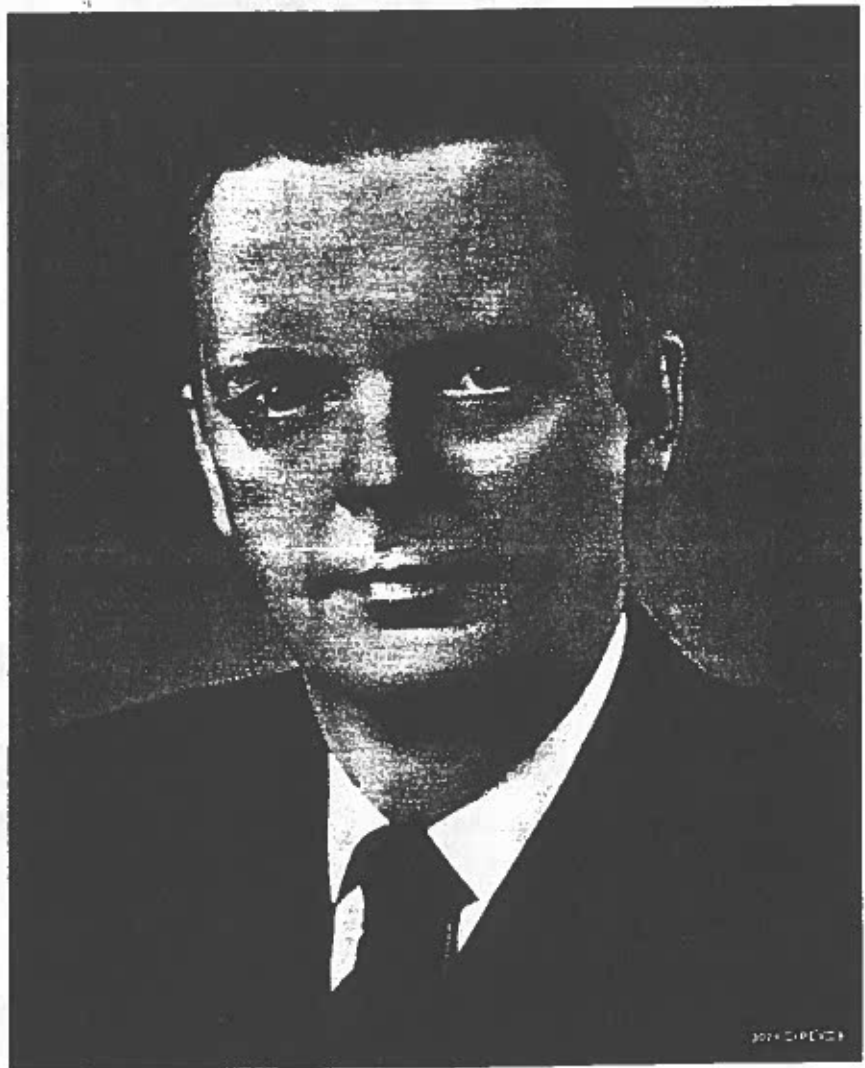
THE HONORABLE WILLIAM G. STRATTON Governor of Illinois